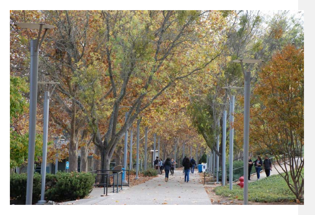
GAVILAN JOINT COMMUNITY COLLEGE DISTRICT Equal Employment Opportunity Plan